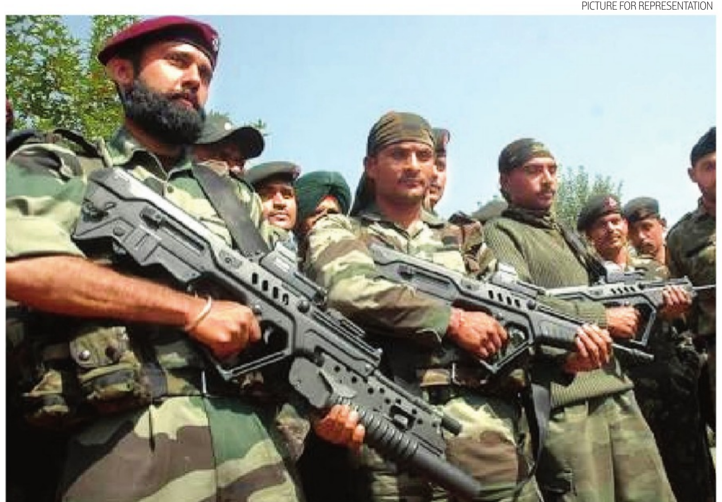
The new manufacturing unit at Malanpur, near Gwalior, will have testing and firing range facility where the Galil-style weapons (seen above) could be tested.